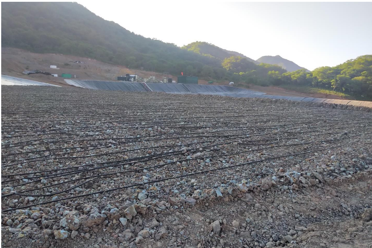
Photo 2 – Drip lines placed on heap leach pad with gold leaching having commenced

The primary focus of the early ramp-up operations at Nicho Norte is to move the mine into commercial production while efficiently minimizing the upfront capital requirements. The scale of mining operations will continue to increase as the available working area for equipment in the starter pit expands with depth. In addition, the amount of mineralized material available for gold extraction (as a % of the total material stacked on the leach pad) will also continue to increase. Currently a significant portion of this material (and the contained gold) is unavailable for recovery as it is located in areas being utilized as working surfaces for equipment to stack new material on the leach pad. This situation will continue to improve as the ramp-up continues.